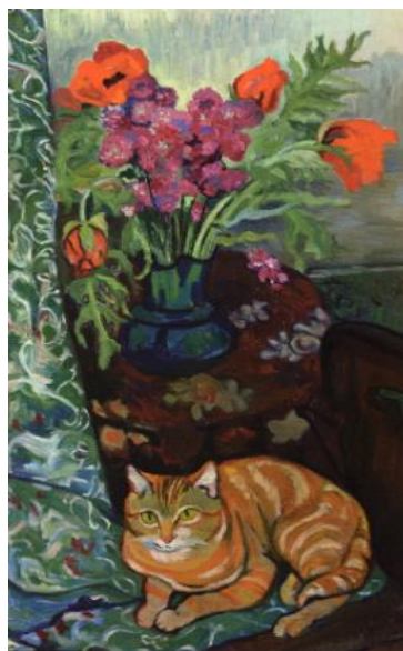
Bouquet and a cat 1919

-Her works are in the collections of the Centre Georges Pompidou in Paris, the Art Institute of Chicago, and The Museum of Modern Art in New York.