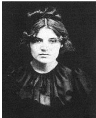
Period – Post Impressionism